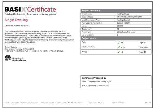
Figure 2 BASIX Certificate

As all residential work undertaken in New South Wales is conducted through BASIX, the SHGC tolerance of ±10% applies to all work, even if a NatHERS Certificate is supplied.