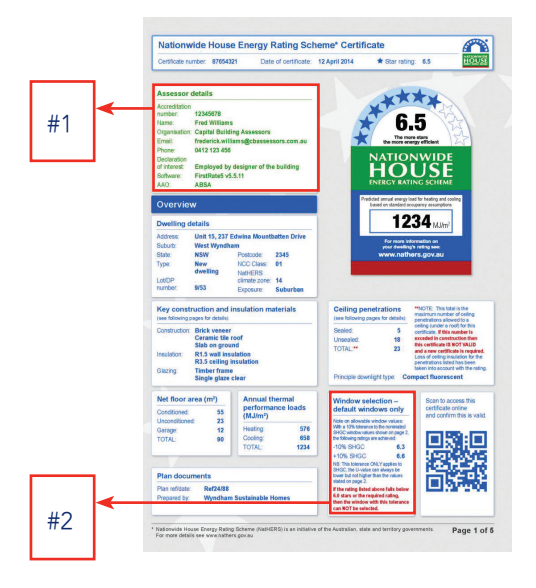
Figure 4 NatHERS Certificate Non- Accredited Rater